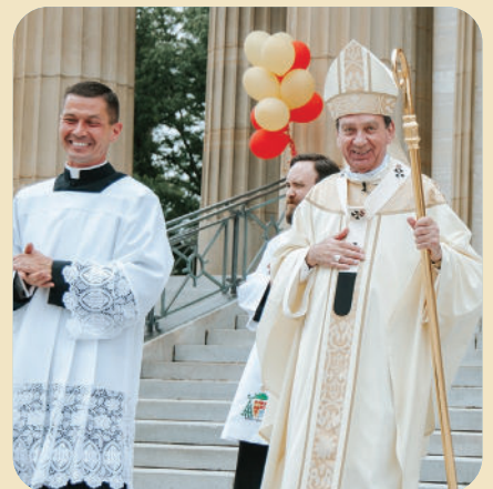
2022 at the archdiocesan bicentennial Mass