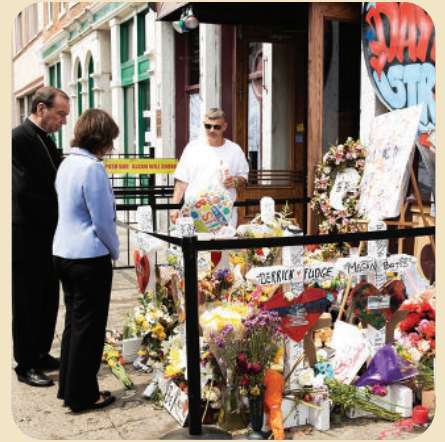
2019 at the Dayton mass shooting site