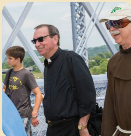
2015 at Cross the Bridge for Life