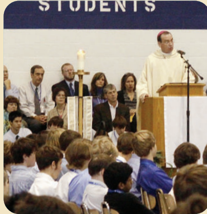
2009 at Catholic Schools Week