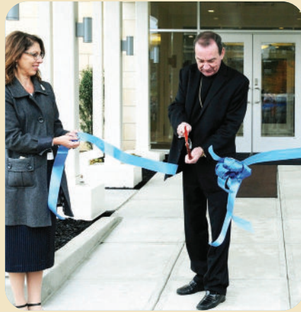
2018 at the Gate of Heaven ribbon cutting