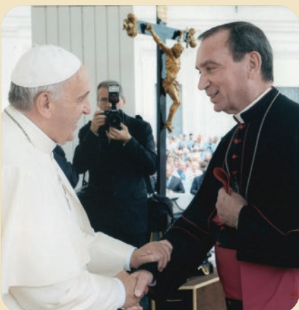
2014 with Pope Francis