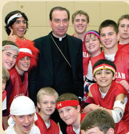
2012 with Guardian Angels students