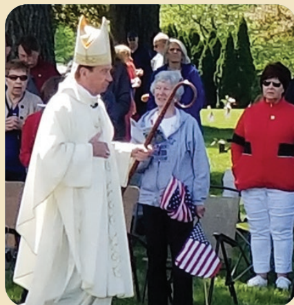
2021 at the Gate of Heaven Memorial Day Mass