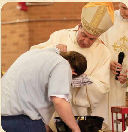
2020 at Dayton Correctional Facility