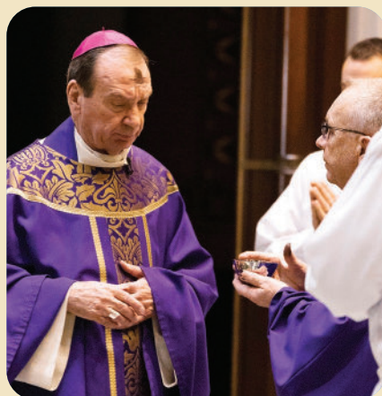
2024 at Ash Wednesday Mass at the Basilica