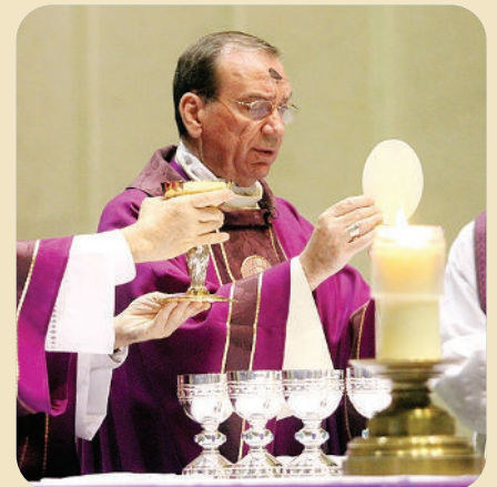
2013 at Ash Wednesday Mass