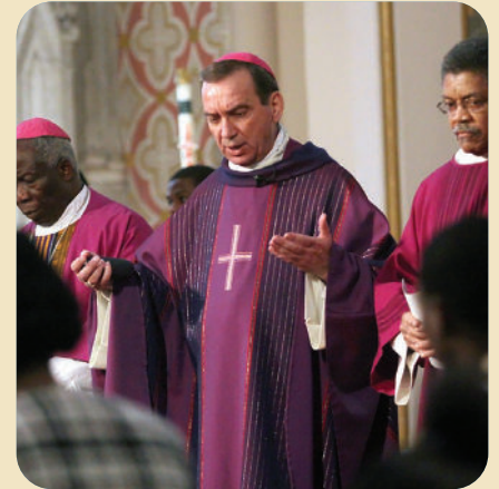
2010 at the African Summit