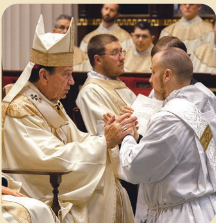
2023 at the priesthood ordination Mass